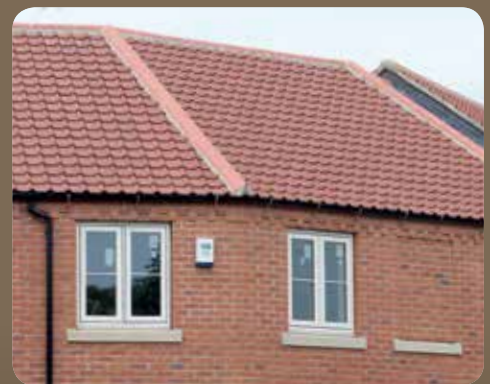
Postel Clay Tile, Brindle, Mell Homes, Fosters Croft