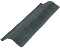
Hip Support Tray