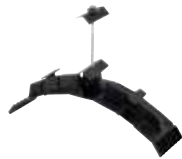
Universal Flexi Seals with 100 x 4mm woodscrews, washers and clamping plates (22 sets)

Uni-Vent Rapid Ridge/Hip is a simple and quick to install system providing a secure, weathertight and mortar-free universal solution for the mechanical fixing of ridge and hip tiles. The system is suitable for most flat and profile interlocking tiles, all slates and plain tiles.