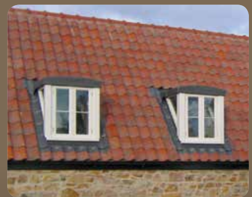
Old Hollow Clay Pantile, Vintage Red, Blampied Farm, Jersey