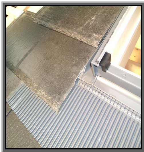
Double Tile at bottom

The foam should be trimmed and the very outer turnback can be bent to sit a little flatter to accommodate verge hooks to be placed against the large metal upstand.