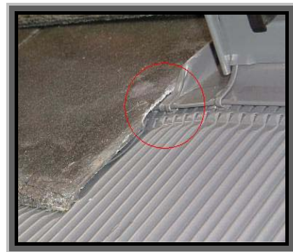
“ Notch “ at aluminium fold

The next tile to the bottom left and bottom right should then be a double tile, which should be trimmed to the side of the metal upstand. Where the tile sits against the fold in the aluminium a small “ notch “ should be taken out to allow the tile to sit.